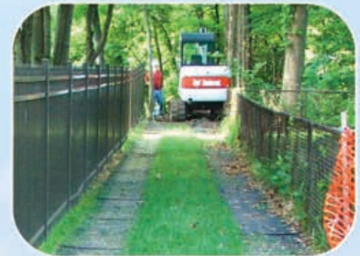
With GEORUNNER® System: Protection to turf and underlying soils

The GEORUNNER® surface protection system is ideal for minimizing soil compaction and turf damage caused by concentrated light-to-medium