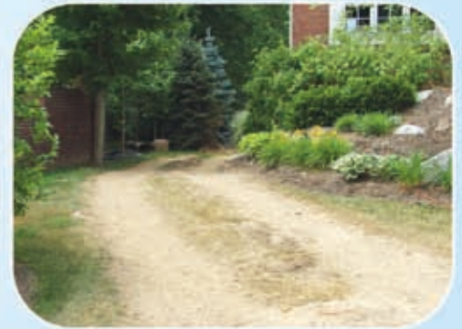
Without GEORUNNER® System: Typical rutting and turf damage