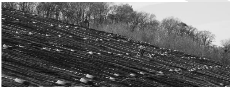
Temporary Rain Shed Cover

DURA-SKRIM 8BBR, 8WB, 12BBR and 12WB are available in a variety of widths up to 80,000 square feet. All panels are accordion folded and tightly rolled on a heavy-duty core for ease of handling and time saving installation.